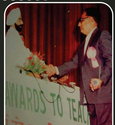
PRESIDENT OF INDIA, GIANI ZAIL SINGH AWARDED FOR HIS CONTRIBUTION IN THE FIELD OF EDUCATION